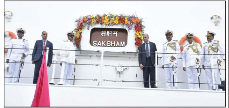
Offshore Patrol Vessel 'Saksham'

The ship displaces approximately 2,350 tons (gross