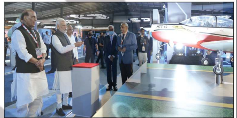
Prime Minister Shri Narendra Modi with Raksha Mantri Shri Rajnath Singh at the Def Expo 2022.

The 12th and largest-ever defence exhibition, DefExpo 2022, - marked the emergence of India's defence industry as a