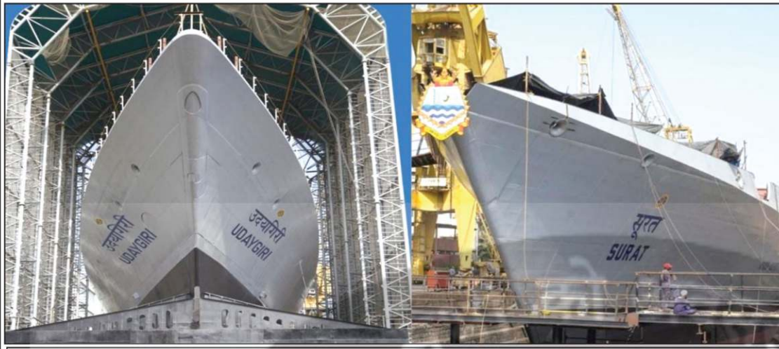
Stealth Frigate 'Udaygiri' and Stealth-Guided Missile Destroyer 'Surat'

has been indigenously designed with state-of-the-art weapons, sensors, an advanced action information system, an integrated platform management system, world-class modular living spaces, a sophisticated power distribution system and a host of other advanced features. It is also fitted with a supersonic surface-to-surface missile system.