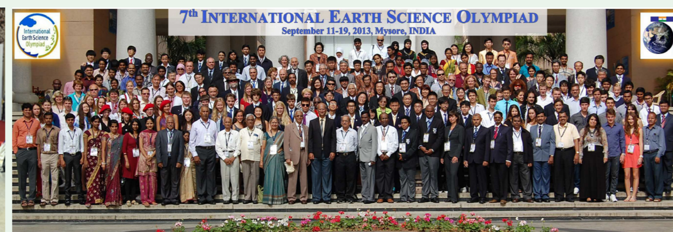
Group photo of 7th IESO participants.