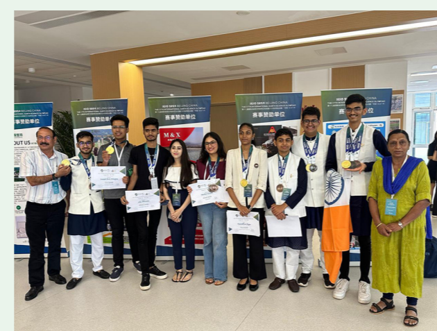
Team India with other award Winners