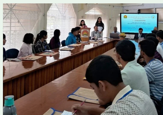
Inauguration of the Training Camp at NEHU, Shillong

The centre registration for the Entrance Test will remain open from 11th November 2024 to 20th December 2024 and the Student registration will remain open from 18th November 2024 to 24th December 2024, for details visit our website: https://gsi.manageexam.com/