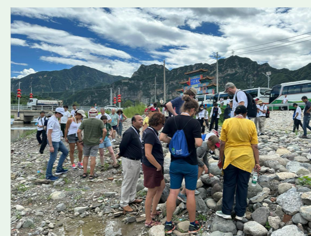
IESO participants studying in the field