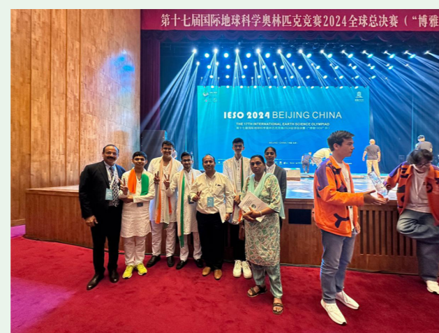
Team India with Mentors and Observers